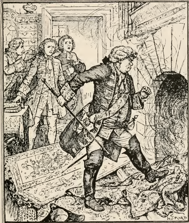
He stamped it down with his heavy boot

attack of gout, he aimed a blow with his crutch at Wilhelmine. The girl sprang aside, and it fell harmless, but this only increased the king's fury, and he called to the attendants to push his chair quickly so that he might